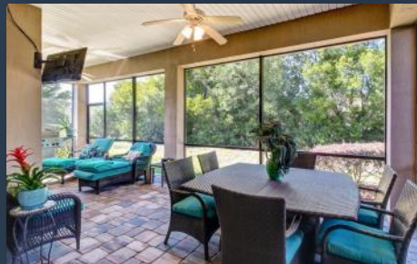
COVERED & SCREENED PORCH