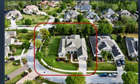
LARGE CORNER LOT WITH PRIVACY