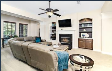
GREAT ROOM / LIVING ROOM