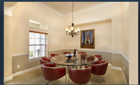
FORMAL DINING / MULTIFUNCTIONAL