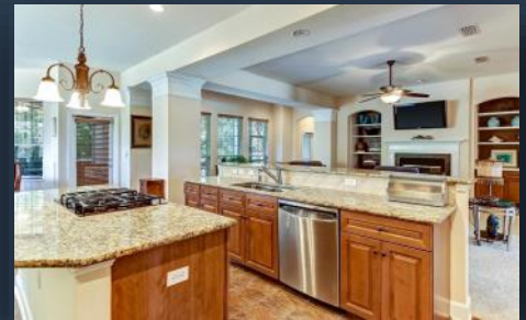
ISLAND WITH GAS RANGE