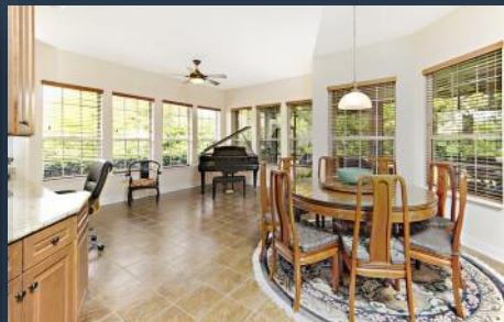
FAMILY ROOM / DEN