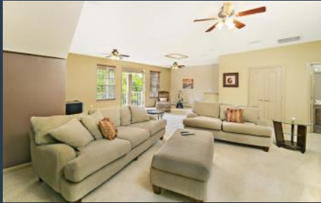
CAN BE UTILIZED FOR MULTIPLE PURPOSES