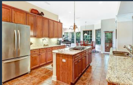
EXTRA LARGE GOURMET KITCHEN