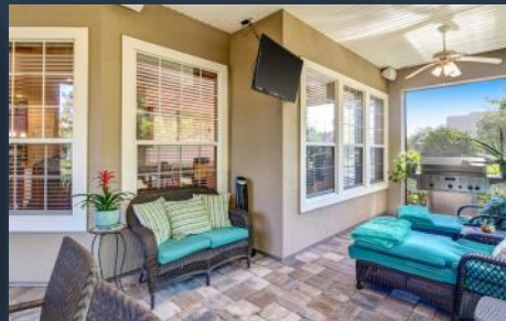
WITH INTEGRATED AUDIO SYSTEM