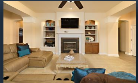
FIRE PLACE & CUSTOM SHELVES