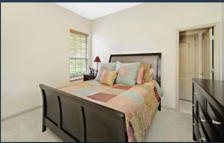
SPACIOUS GUEST BEDROOMS