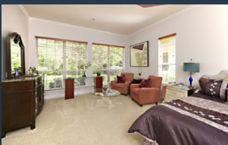
WITH SITTING AREA