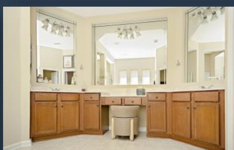
DUAL VANITY & MAKEUP SECTION