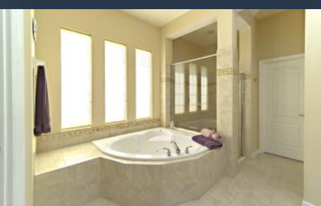
MASTER BATHROOM W. WHIRLPOOL TUB