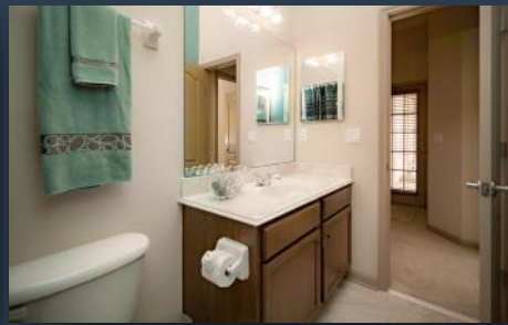
3 ADDITIONAL BATHROOMS + GUEST WC