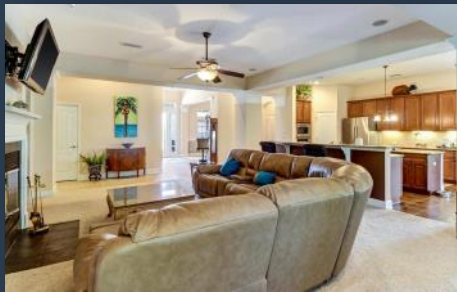
VERY LIGHT & SPACIOUS LIVING AREA