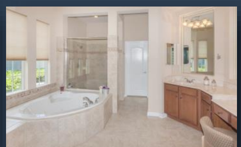
SEPARATE WC ROOM & WALK-IN CLOSET

This home offers space, comfort and a floor plan that suits a lifestyle applicable to a wide variety of future owners.