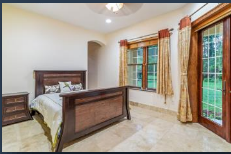
GROUND FLOOR GUEST BEDROOM SUITE