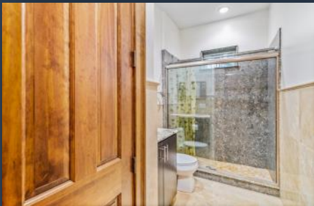
2 x FULL BATHROOMS UPSTAIRS