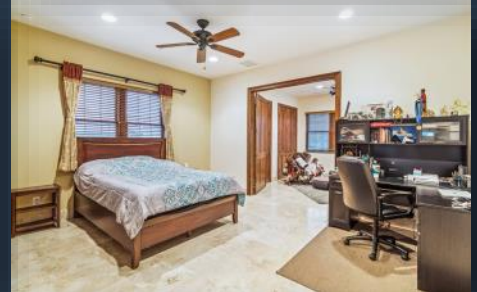
4 TH BEDROOM SUITE W/SITTING ROOM