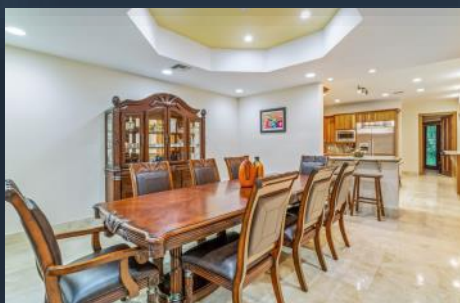
MARBLE FLOOR ALL OVER THE HOUSE