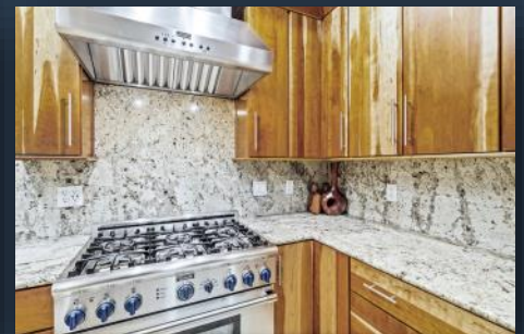
GAS COOK TOP