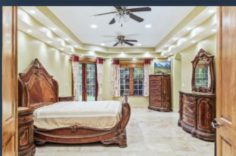
LARGE MASTER BEDROOM SUITE