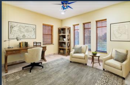
5 TH BEDROOM / STUDY / OFFICE