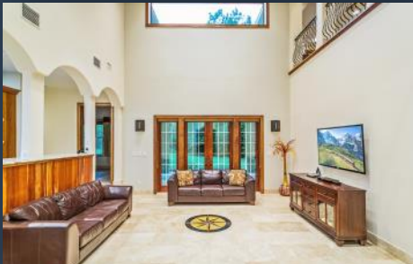
GREAT ROOM / LIVING ROOM