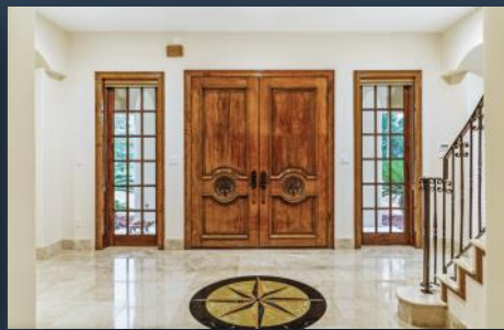
HAND CARVED HARDWOOD MAIN DOORS