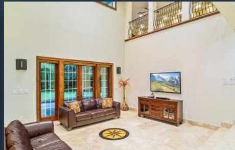
HIGH VAULTED CEILING