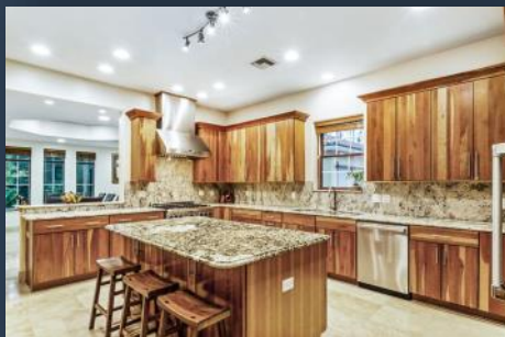
LUXURIOUS CHERRY WOOD CABINETS