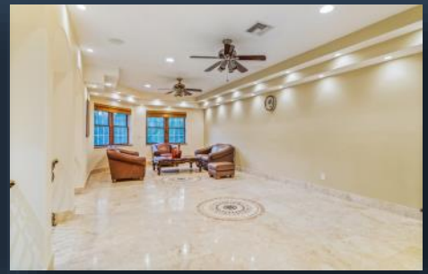
LARGE FAMILY ROOM / DEN - UPSTAIRS