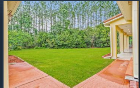
LARGE BACKYARD WITH PRIVACY