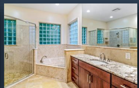
MASTER BATH WITH GRANITE & MARBLE

This home offers space, comfort and a floor plan that suits a life-style applicable to a wide variety of future owners.