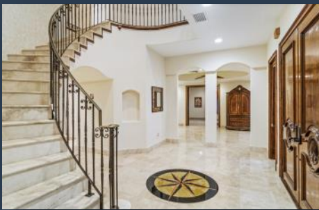
ELEGANT ENTRANCE HALL