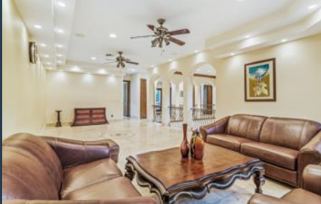
CAN BE UTILIZED FOR MULTIPLE PURPOSES