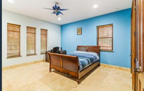
3 RD BEDROOM SUITE