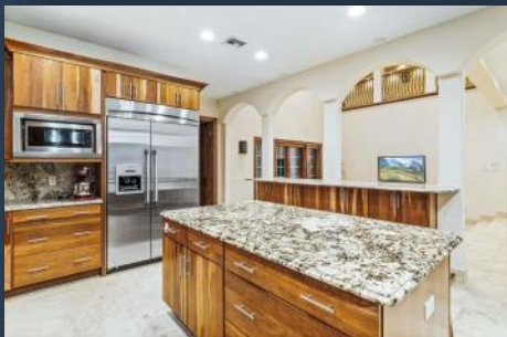
KITCHEN ISLAND & BREAKFAST BAR