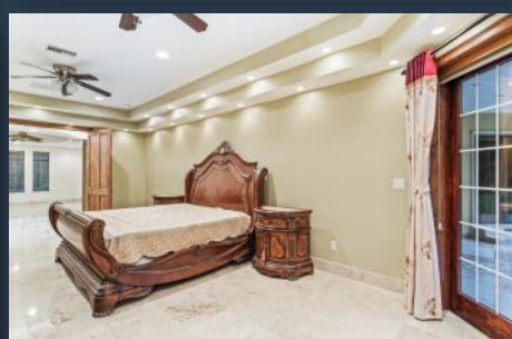
WITH GEOMETRIC CEILING FEATURE