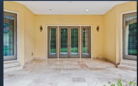
LARGE COVERED BACK PORCH