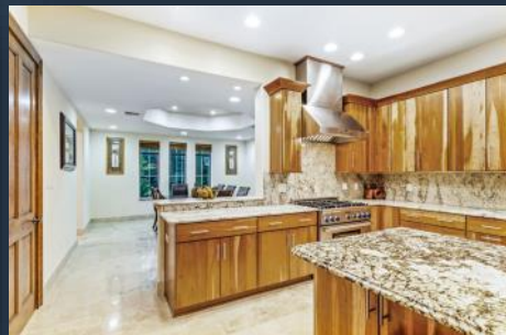
GRANITE TOP'S & GRANIT BACK SPLASH