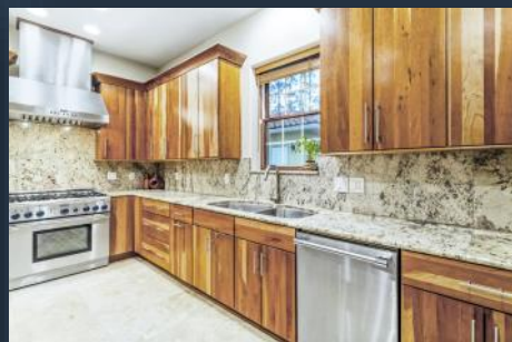
HIGH-END STAINLESS STEEL APPLIANCES